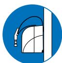
Fits neatly on the wall