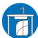
Space saving under table