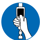
One hand operation