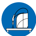
Easy water dispensing