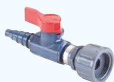
1. Pure water outlet valve