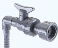
2. Pure water outlet valve