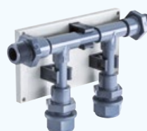
4. Pure water distributor block