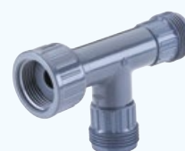
5. Pure water T-connector